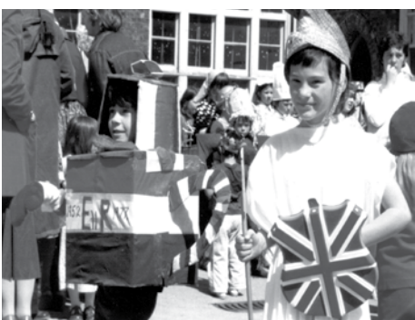
Fancy dress at the Silver Jubilee in 1977. Left, a cardboard teapot; right, Britannia