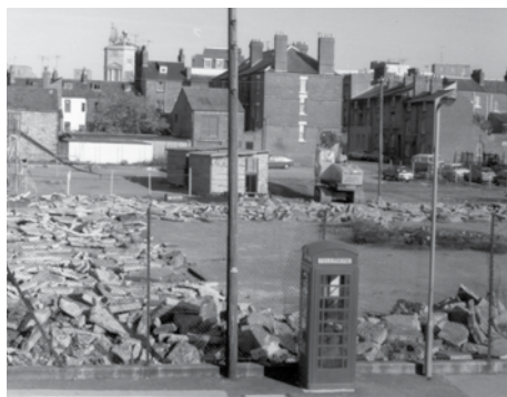
Preparing the site for the school, the telephone box is positioned as now